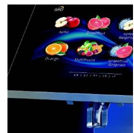
Central dispensing unit with LED