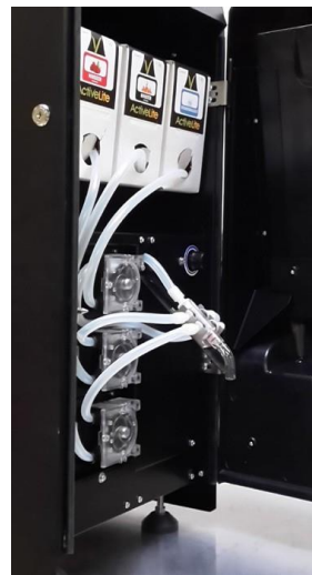
patented MidMix® system inside