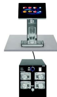
Standard delivery content